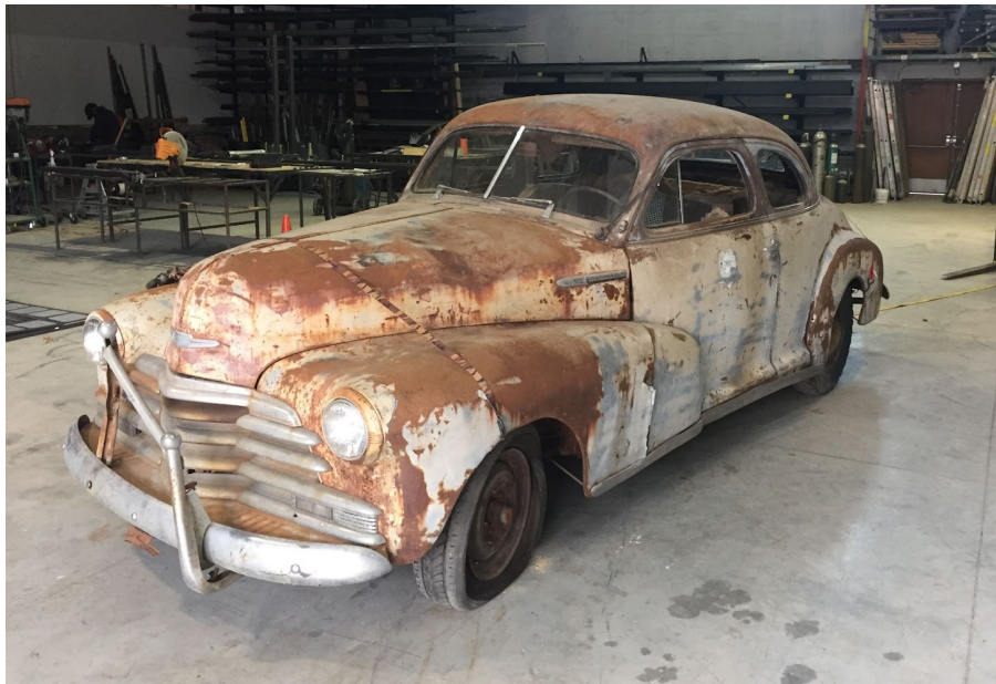
Greased Lightning, the day it arrived in our shop

The car is supported by five tri-swivel zero-throw casters which allowed Greased Lightning to be moved easily onstage when loaded with actors. If the vehicle suddenly rolls in an unusual fashion, check the casters. They likely have become tangled in foreign material that the car rolled over. Items like screws, loose tape, tie-line, and ribbons can all become trapped in the casters and cause them to stop working properly.